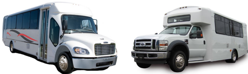
Several lengths of General Motors chassis also available.