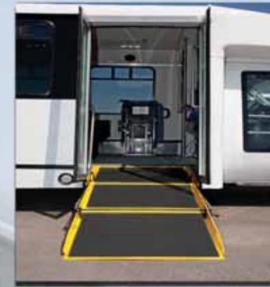
ADA Ramp for easiest entry in the industry