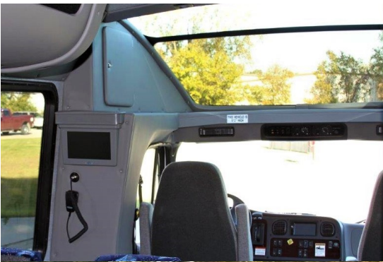
KSIR® Pro Touring M2 Freightliner

The KSIR Pro Touring M2 is rated as the quietest, best riding bus of all the buses in the Medium Duty category. This is due to our custom, hand built construction featuring Galvaneal steel exclusively including the body cage, subfloor, roof trusses, and even the step wells. Thicker Frameless windows and R4.5 density block insulation in the walls effectively block out road noise while keeping the passengers cool in the summer and warm in the winter. The Airliner rear air suspension provides excellent stability in cross winds, reduces body lean in cornering and exit ramps. The “Draft Free” rear A/C unit is mounted in the front bulkhead, and directs air down the ceiling to ensure an even flow of cold air throughout the bus eliminating drafts on the forward passengers. All the A/C components are mounted behind an attractive padded panel; only the vents are visible. Inside this enclosure the evaporator is surrounded by heavy insulation which increases the efficiency of the A/C and also quiets the noise of the A/C unit. Up to 42 passengers in addition to the Driver & Copilot ( Model M2-400 40’). Sizes from 36’ to 45’ available. Popular Optional Vista Window Shown below.